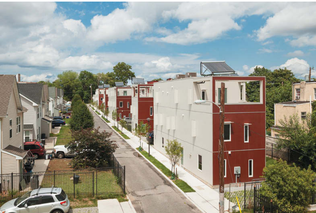
A block of green affordable housing on Sheridan Street developed by Asociacion Puertorriquenos en Marcha. Designed by ISA.