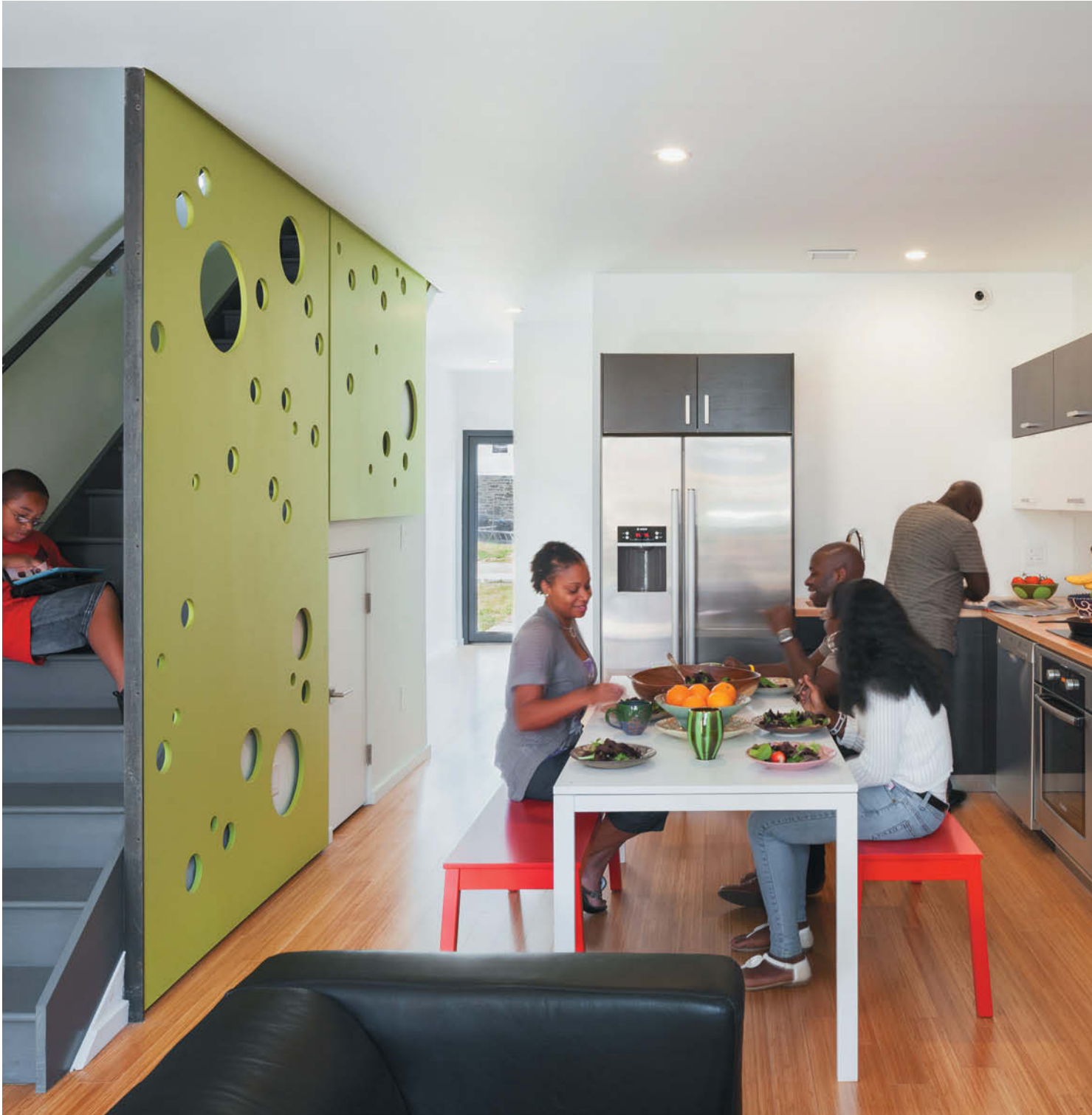
The family space of Belfield Townhouses. It is the first Certified Passive House project in Pennsylvania. Designed by Onion Flats.